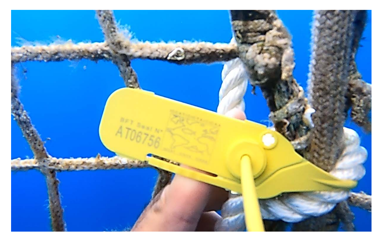
Figure 2: Screenshot of cage seal during sealing operation,