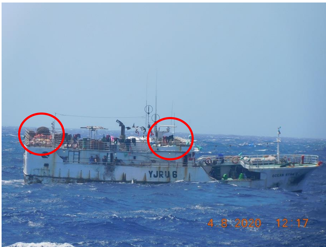
Figure (B) USCG Photograph of FV OCEAN STAR NO 2 during the patrol on 8 April 2020. The red circle identifies longline fishing gear observed on the decks of the vessel.