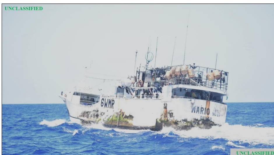
Figure (A) USCG sighting location of FV MARIO NO 11 during the patrol on 6 May 2020.