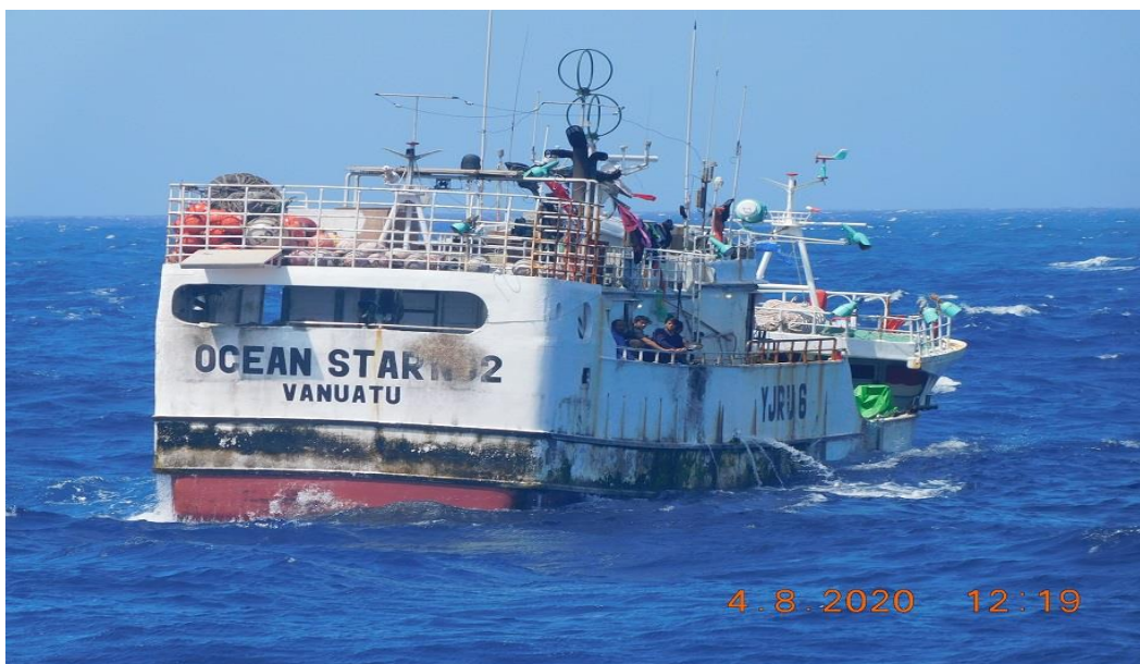
Figure (C) Photograph of FV OCEAN STAR NO 2 during the patrol 8 April 2020. The red circle highlights the name of the vessel and flag State painted on the vessel's stern.