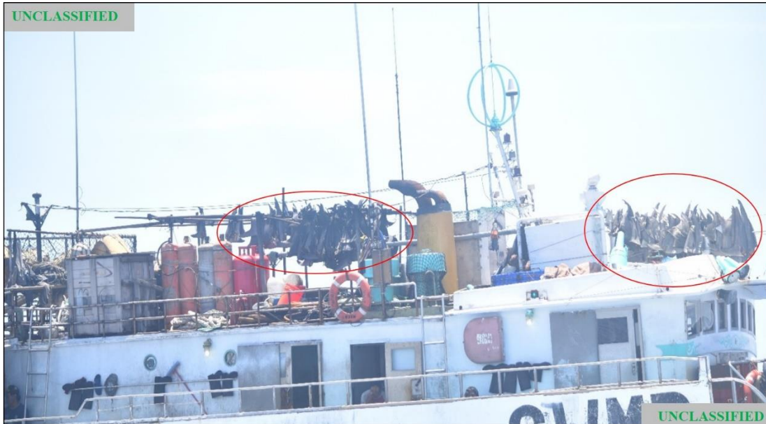
Figure (C) USCG Photograph of FV MARIO NO 11 during the patrol 6 May 2020. The red circle highlights the shark fins hanging above the decks.