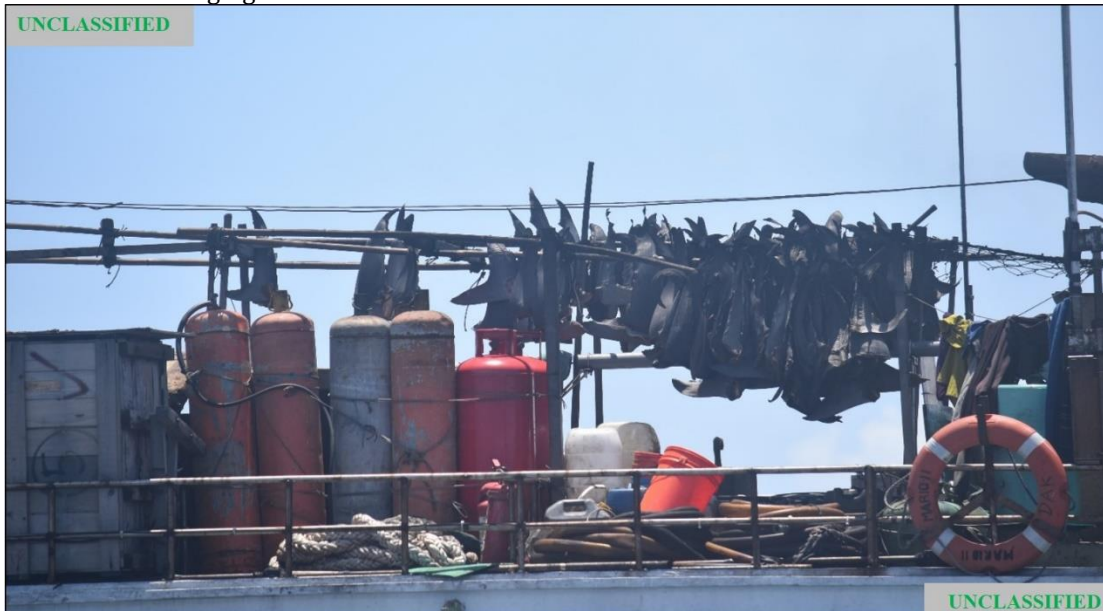
Figure (D) USCG Photograph of FV MARIO NO 11 during the patrol 6 May 2020 showing a close up of the shark fins hanging above the deck.