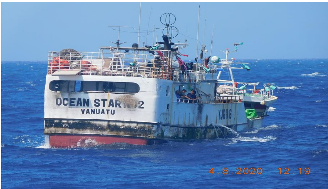
Figure (C) USCG Photograph of FV OCEAN STAR NO 2 during the patrol 8 April 2020. The red circle highlights the name of the vessel and flag State painted on the vessel's stern.