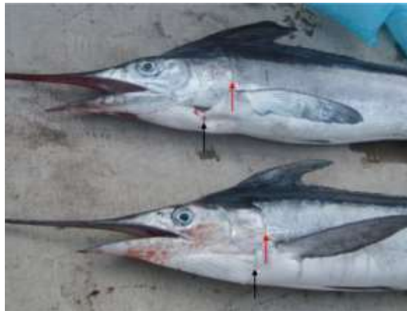
Figure 3. Comparative lengths of branchiostegal rays (black arrows) in white marlin (upper) and roundscale spearfish (lower) relative to posterior edge of operculum (red arrows, photo courtesy of Meredith Jones ).