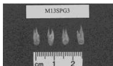
Figure 2. Examples of roundscale spearfish mid-lateral scales.