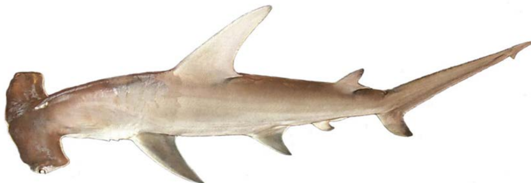
Figure 1. Great hammerhead ( Sphyrna mokarran ) (Rüppell 1837).