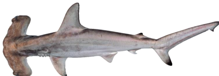
Figure 1. Scalloped hammerhead ( Sphyrna lewini ) (Griffith & Smith, 1834). Image taken by Domingo et al. , 2010. Photo credit: CSIRO Marine and Atmospheric Research, Australia.