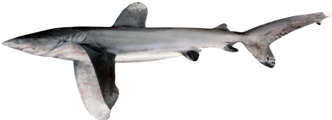
Figure 1. Oceanic whitetip shark ( Carcharhinus longimanus ) (Poey, 1861).

Characteristics of Carcharhinus longimanus (see Figure 1).