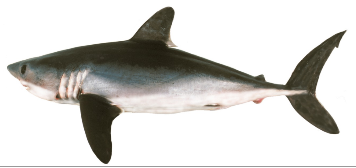
Figure 1. Porbeagle ( Lamna nasus ) (Bonnaterre, 1788).

Characteristics of Lamna nasus (Figure 1).