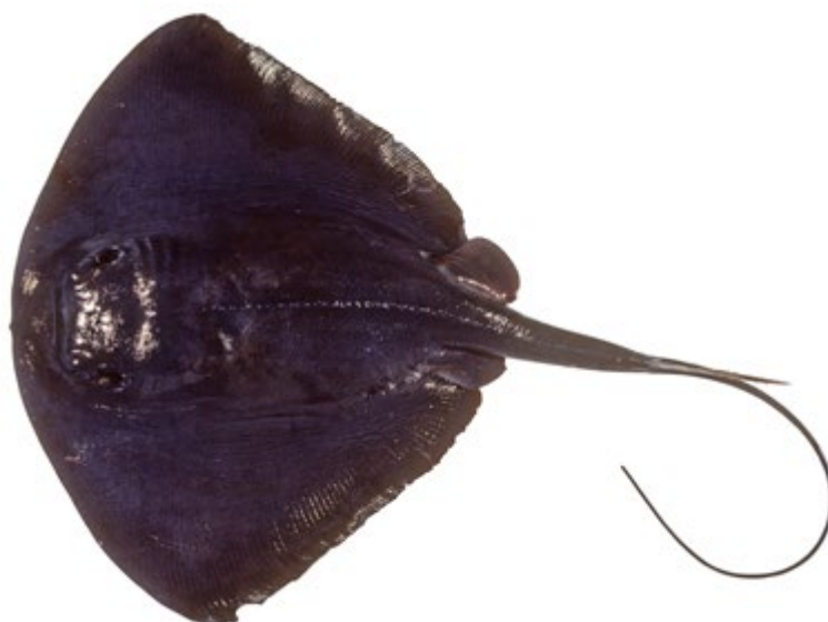
Figure 1. Image of a violet stingray Pteroplatytrygon violacea .

It was originally described in the Mediterranean Sea and Atlantic Ocean by Bigelow and Schroeder (1962). It is medium size, around 60 cm and reaches a maximum of 90 cm disc width (DW) (Vaske Júnior and Rotundo, 2012). It is the only pelagic ray species (Mollet, 2002).